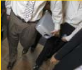
The perfect lifestyle projector.