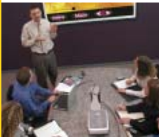
...or at work.