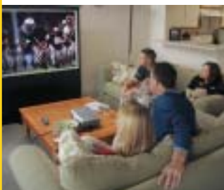
Instant home entertainment.