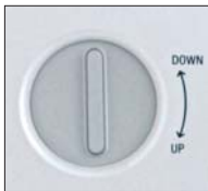
Vertical compensation of up to 50%

One convenient hand-motion – and the NP1000/2000 image is ideal. The manual lens shift function lets you shift the optical unit. This feature allows up to 50% vertical displacement and up to 10% horizontal displacement. So even if the projection angle is unfavourable, your images will be distortion-free and lose none of their quality.