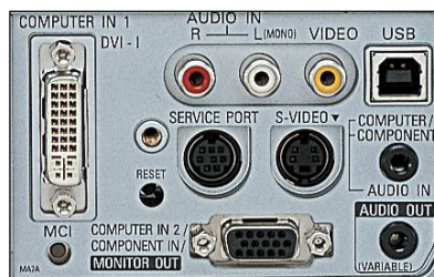
PLC-XU56/XU51 Terminal Input Panel

Because its products are subject to continuous improvement, SANYO reserves the right to modify product design and specifications without notice and without incurring any obligations.