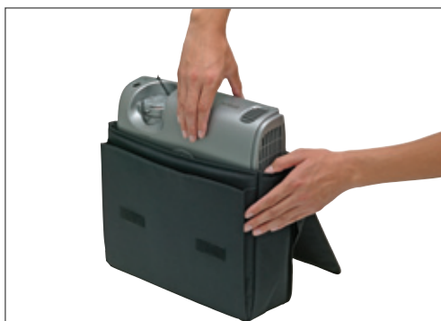
Compact and lightweight - ideal for moving from room to room